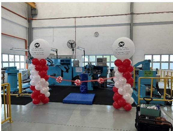
New cutting machine

Looking ahead to the next 10 years, the cutting machine to be introduced this time aims to expand sales to Southeast Asian countries and India, improve quality, and strengthen the BCP system with NIPPON KINZOKU (THAILAND) CO., LTD.(Headquarters: Ayutthaya, Thailand, hereinafter "Nikken Thailand"), which is also a group company.