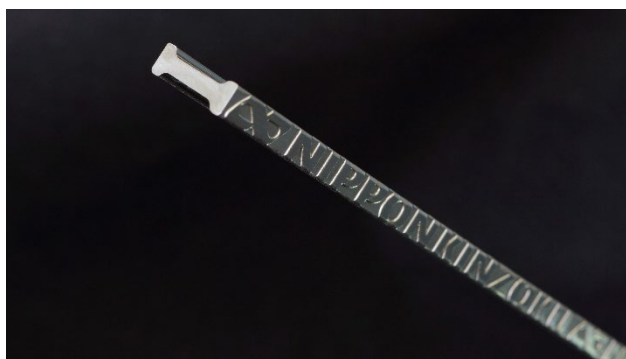
I bar with company emblem and "NIPPON KINZOKU" logo

*: The anti-slip effect varies depending on the knurling pattern.