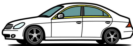
Automotive Exterior Molding (Yellow colored part)

In addition, NIPPON KINZOKU's materials for automotive exterior moldings are also environmentally friendly products “eco-products” certified under our own standards, because it enable customers to reduce their environmental impact. Our goal is to achieve Net Zero CO 2 emissions by 2050, and we will contribute to the realization of carbon neutrality by expanding sales of our “eco-products”.