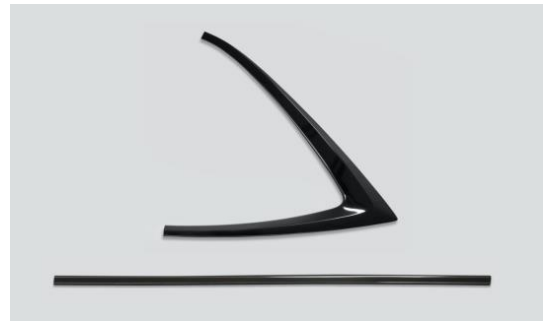
Example of a prototype sample (Left : PW finish, Right : FB finish)