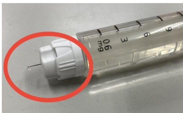
Insulin needle (typical needle size: 32G)

We would like to announce that we are currently making progress in expanding sales to overseas markets.